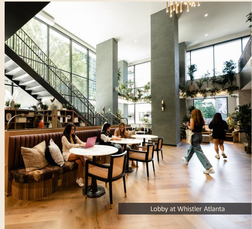
Lobby at Whistler Atlanta