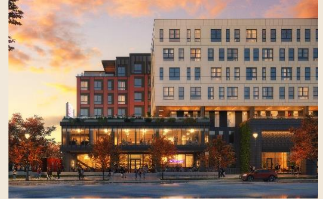
222 W. Lane Columbus, Ohio