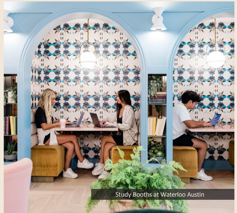
Study Booths at Waterloo Austin