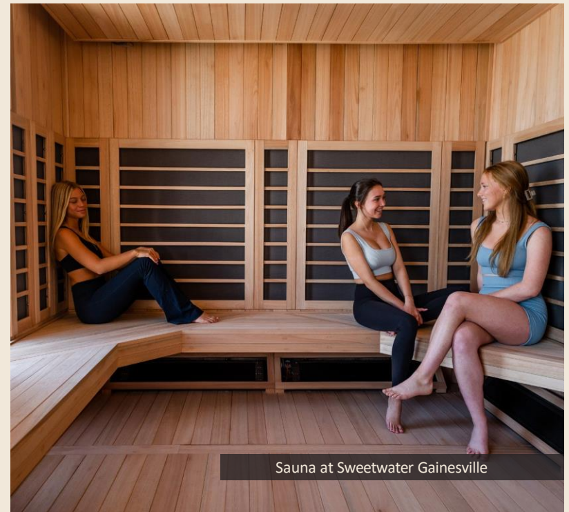
Sauna at Sweetwater Gainesville