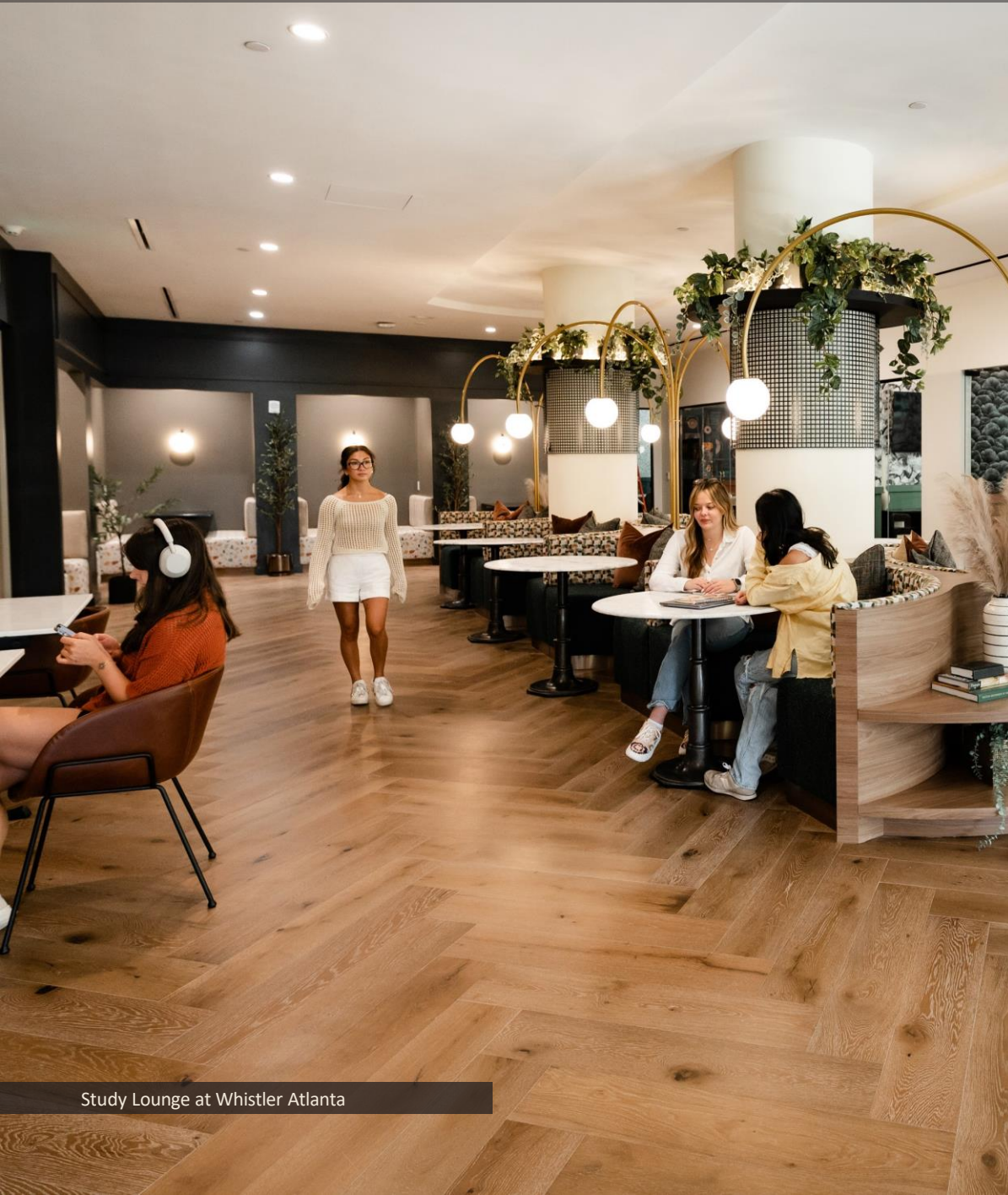
Study Lounge at Whistler Atlanta