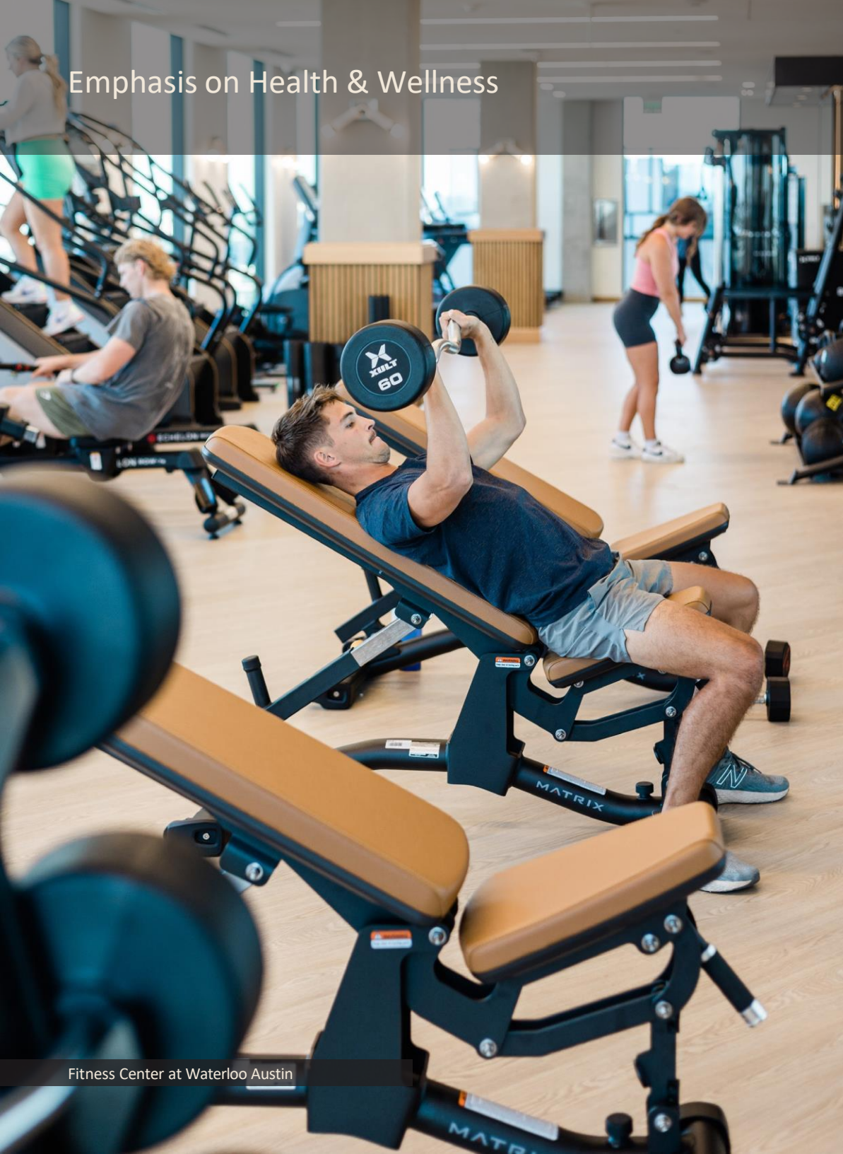
Fitness Center at Waterloo Austin