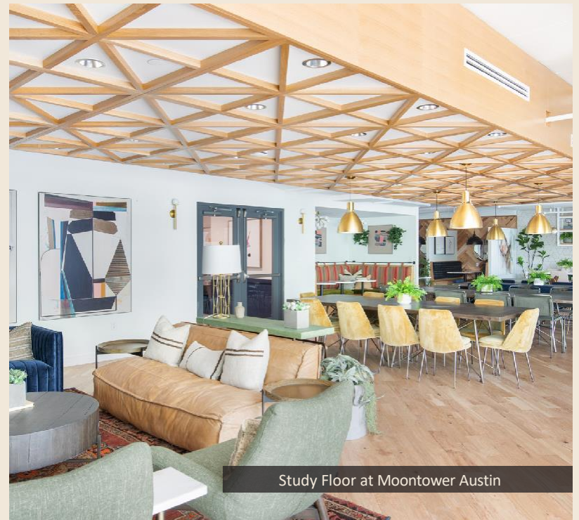
Study Floor at Moontower Austin