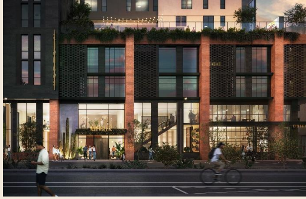
1020 E. Apache Tempe, Arizona