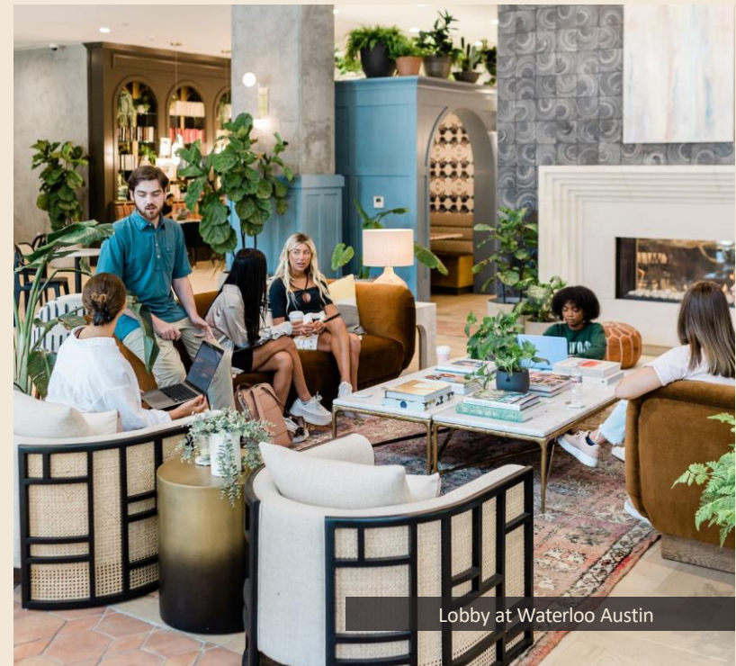
Lobby at Waterloo Austin