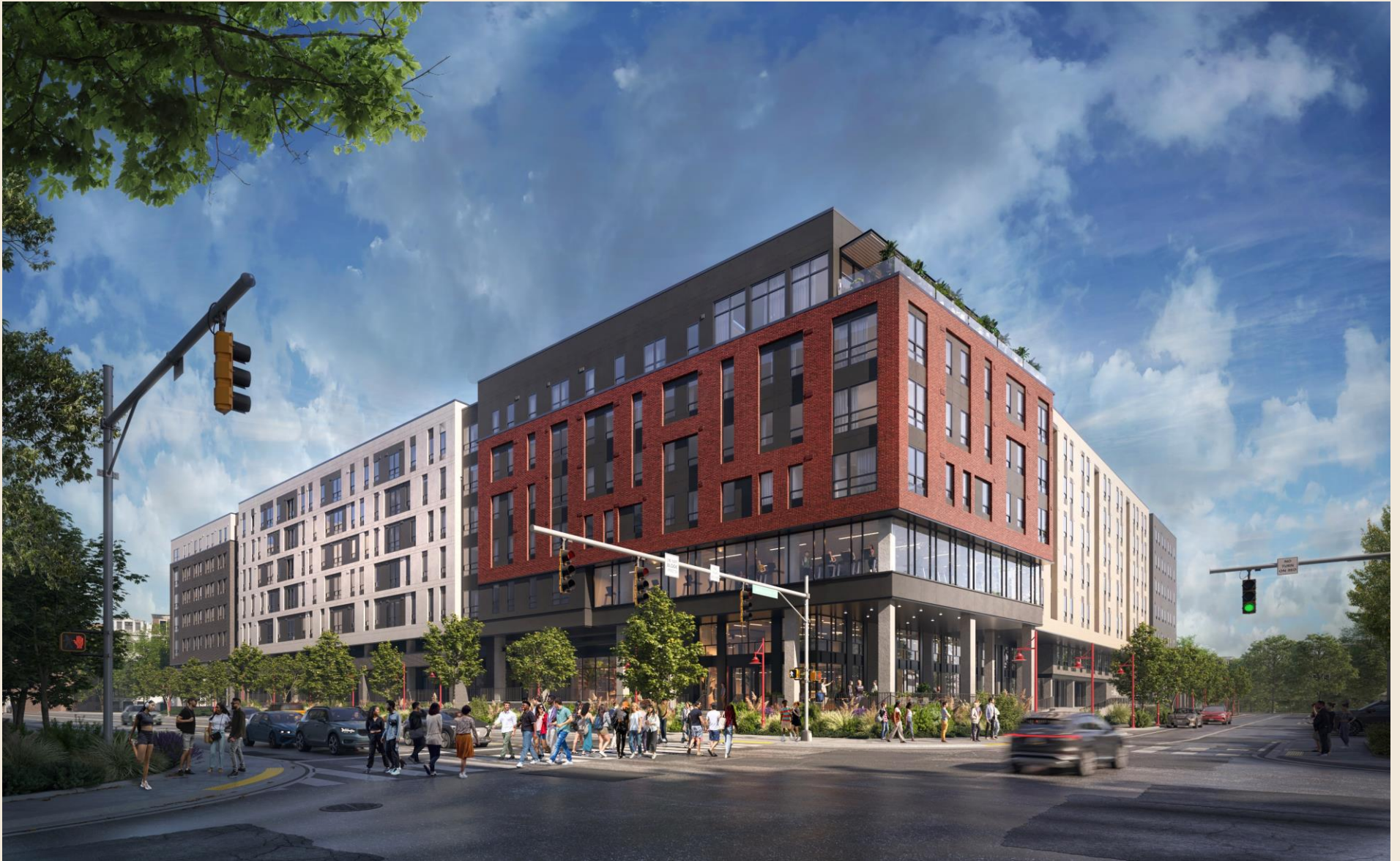
8145 Baltimore 'Project Turtle' View from Baltimore Ave (Rt. 1) and Melbourne Place