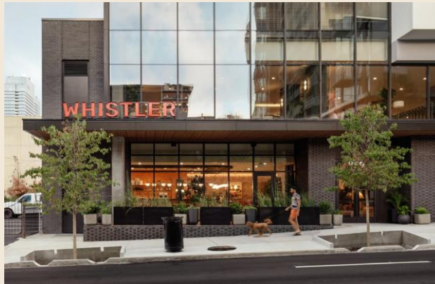
Whistler Atlanta, Georgia