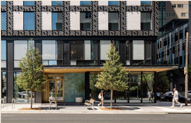
Waterloo Austin, Texas