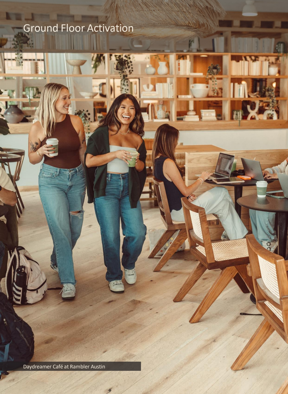
Daydreamer Café at Rambler Austin