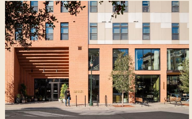
Rambler ATX Austin, Texas